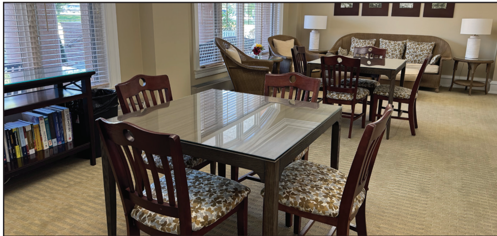
Summer upgrades included refreshing the parlor furniture with study areas conducive to group and individual study

M aking educational improvements and upgrades in the chapter house is an important part of the Educational Foundation’s mission. In previous years, we purchased computers and printers, partnered with the FCB in upgrading the Wi-Fi throughout the house, and installed outlet ports under the tables in the library.