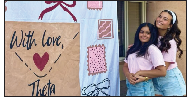
The recruitment team (pictured in white) worked all summer organizing work week and the various activities needed to get Thetas ready for recruitment. Bid Day brought 46 new members to 607 N. Russell!